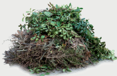
Pruning debris, green waste and hedge trimmings