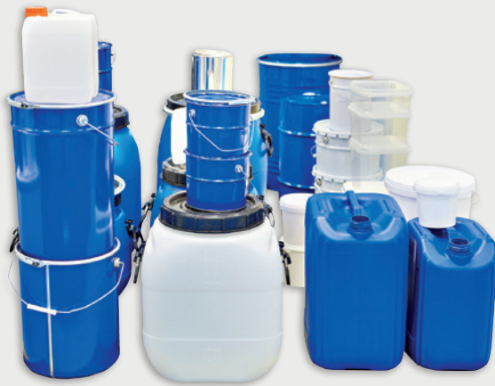
plastic and metal containers up to 15 litres