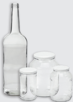
Glass up to Ø 70 mm